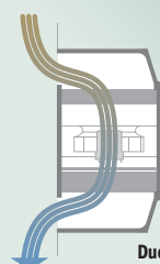
Ducting Flairs™ mounting system application